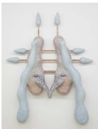
ZSÓFIA KERESZTES Common interest, 2018