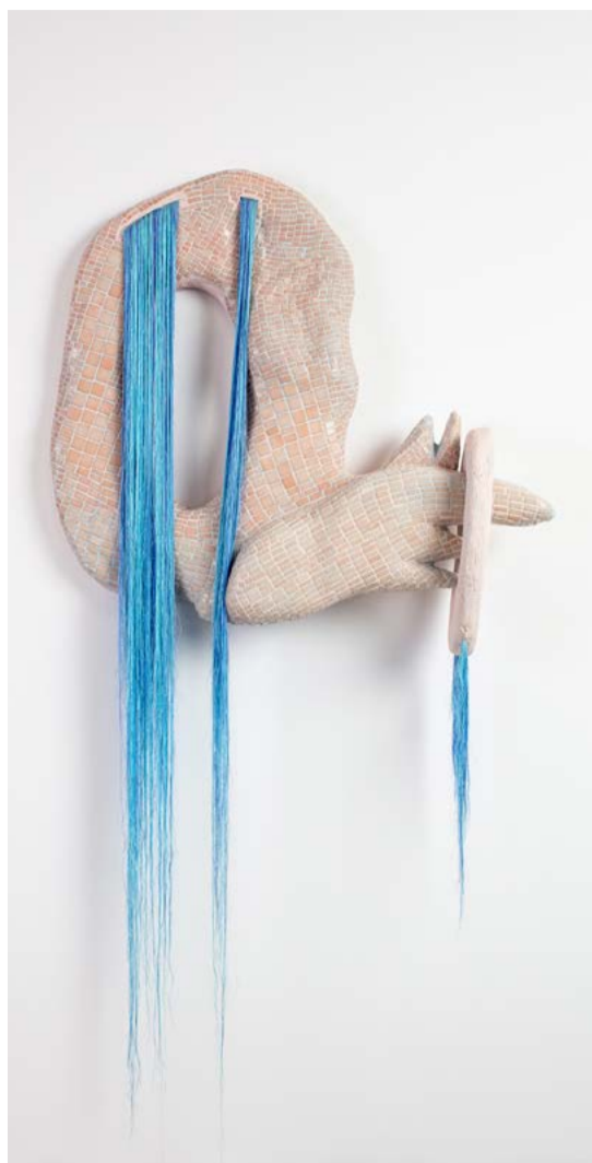
ZSÓFIA KERESZTES Self-portrait of the cannibal - 2017