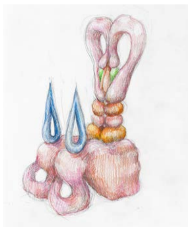
ZSÓFIA KERESZTES Drawings for the exhibition of the Hungarian Pavilion of the 59th Venice Biennale, 2020