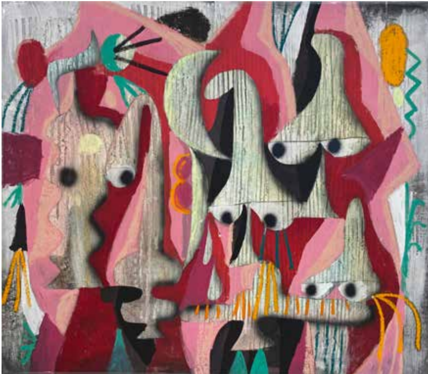
JÓZSEF CSATÓ: BURGUNDY VIBES, 2022 oil, acrylic, canvas 140 x 160 cm