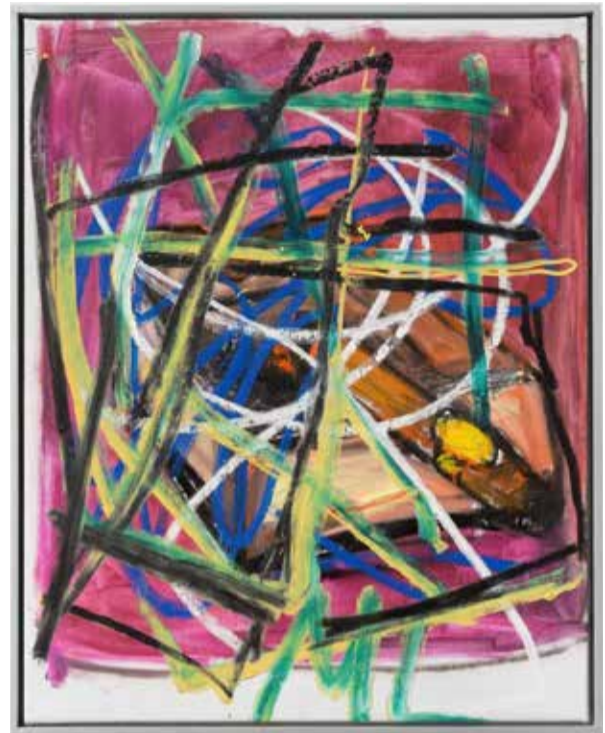
MARTIN LUKÁČ: STILL LIFE WITH A CIGAR, 2023 oil, oil stick, canvas 85 x 106,5 cm