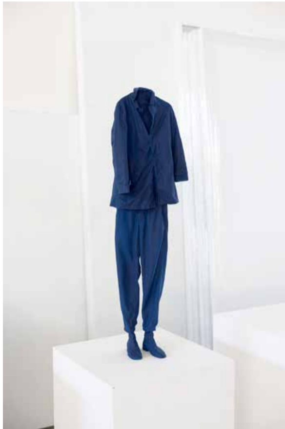
ERWIN WURM: GHOST (SMALL), 2022 aluminium, paint 100 x 28 x 16 cm