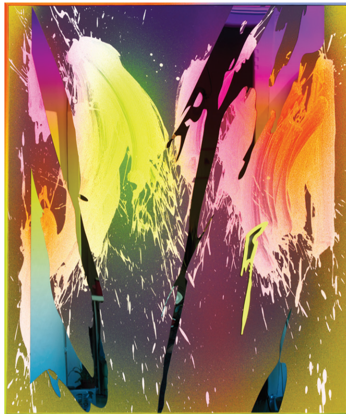
MÁRTON NEMES: NOTHING WITHOUT 23, 2021 PVD-coated stainless steel, acrylic, canvas, wood 120 x 100 cm